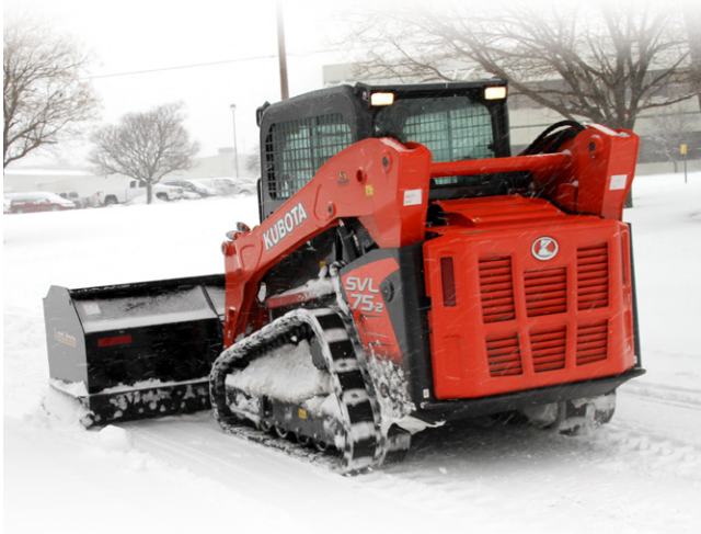
The SSP25 boasts up to 5,000 lbs. of lift capacity.

Replaceable skid shoes are manufactured from high tensile AR400 steel, and are abrasion resistant.