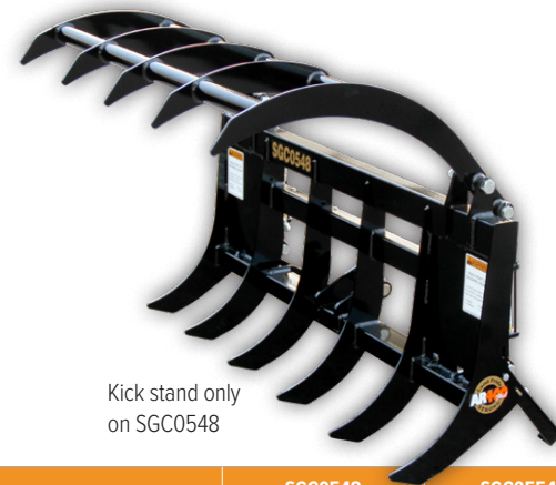
Kick stand only on SGC0548

Our SGC05 tines are manufactured from high-tensile AR400 Steel to make sure it stands up to demanding use. For added strength, the frame is made of 2" x 3" rectangular tubing. And it carries the Land Pride name, so you know quality is built in.