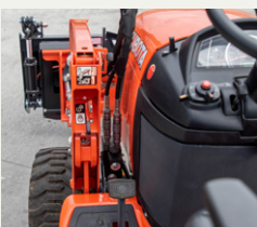
Land Pride 3rd Function Valve accessory kit adds versatility to your tractor.

Tines are manufactured from high tensile AR400 steel, making the grapple lightweight, yet extremely durable.