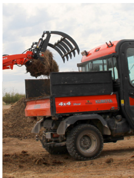
30" Jaw opening and open back for good visibility from tractor seat.