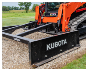
Full length, heavy-duty skid shoes are reversible and replaceable.

Landscapers, contractors, homeowners, and developers can level construction sites, prepare seedbeds, and rejuvenate driveways forwards or backwards. Ripper teeth break compacted soils for a better finish.