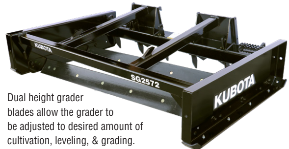
Dual height grader blades allow the grader to be adjusted to desired amount of cultivation, leveling, & grading.