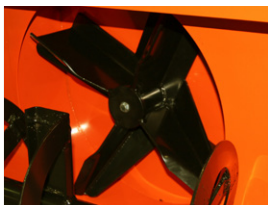
Large 20" or 24" impeller allows snow to be moved quickly and efficiently.