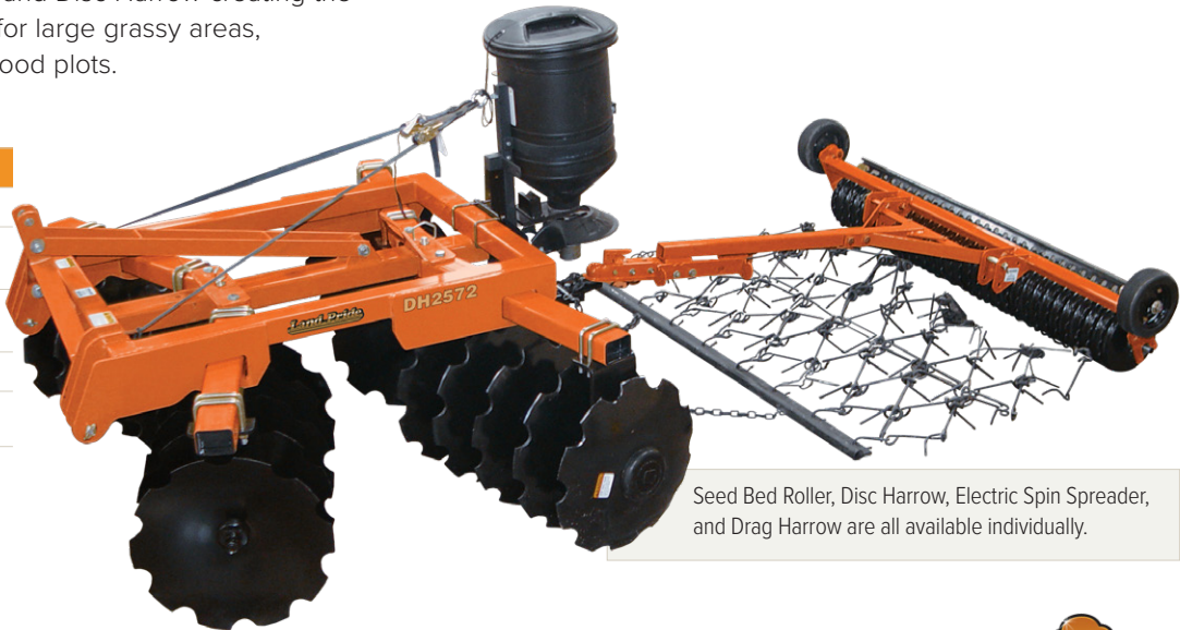
Seed Bed Roller, Disc Harrow, Electric Spin Spreader, and Drag Harrow are all available individually.