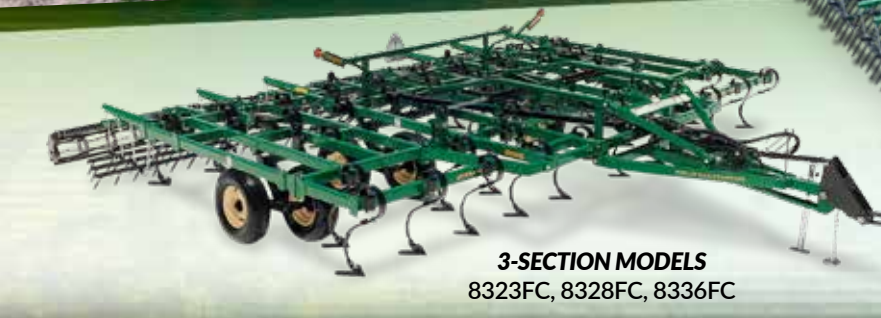
3-SECTION MODELS 8323FC, 8328FC, 8336FC