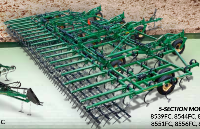
5-SECTION MODELS 8539FC, 8544FC, 8548FC, 8551FC, 8556FC, 8560FC